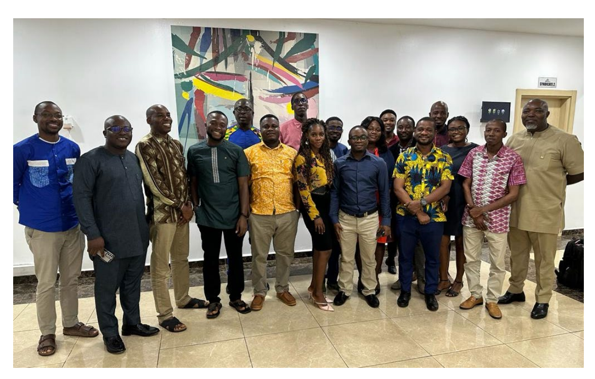
Photo: Members from ACEIR Ghana and civil society organisations who participated in the Oxfam workshop.

The past months have seen the start of a collaboration between researchers from ACEIR's node at the University Ghana and an Oxfam project that aims to contribute to the Sustainable Development Goal to reduce inequality within and among countries. The partnership emerged after Oxfam in Ghana and Oxfam Indonesia identified a dearth of data for this SDG's indicator on the redistributive impact of fiscal policy. This gap, however, was narrowed somewhat (for Ghana) through a study by ACEIR researchers at the University of Ghana who used a novel methodology developed by the Commitment to Equity (CEQ) Institute. The Oxfam project's collaboration started in July with the ACEIR team facilitating a capacity building and strategic workshop for civil society organisations on the use of the CEQ methodology.