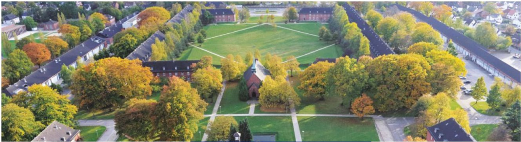
Schools as Research Incubators | Wealth Data Science Summer/Winter School 2024 | Schools 2018-2023

Research Incubators on Conflicts, Migration, Social Cohesion, the Democratic Debate, and Wealth