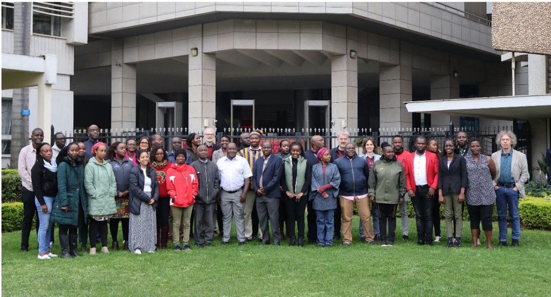
The summer school was hosted at the University of Nairobi Towers campus.

If its inaugural summer school is anything to go by, the Cluster of Research Excellence in Inequalities, Poverty, and Deprivation (CoRE IPD) is off to an excellent start to meeting its objective to nurturing research excellence through education and capacity building. The 2024 summer school – on the roots of inequality, poverty, and deprivation – was attended by 41 early career researchers. The five-day event was hosted at the University of Nairobi where ACEIR’s Kenya node is based.