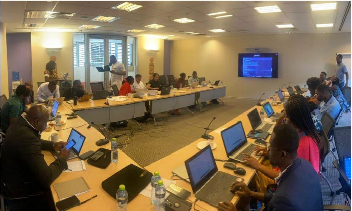
Following the launch, a two-day training workshop facilitated by the World Bank and Oxfam in Ghana gave researchers and civil society organisations the opportunity to get familiar with using the new microsimulation tool.

ACEIR Ghana researchers have collaborated with Oxfam and the World Bank on capacity building for different users of a new microsimulation tool to evaluates the impact of social policies on inequality and poverty in Ghana. The tool can be used to assess government