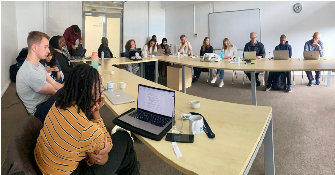
Participants at the WeDSSS African campus at the University of Cape Town.