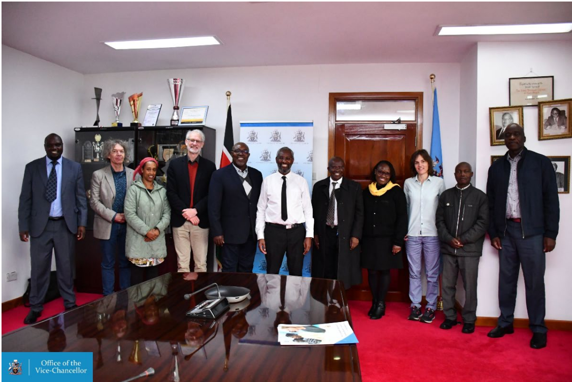
CoRE IPD leaders and researchers following a meeting with the leadership of the University of Nairobi.

The African and European Unions’ joint Innovation Agenda calls for support for research cooperation to develop knowledge together and share technology and expertise in the interest of sustainable and inclusive development. Last month, this mandate was taken forward with the official launch of an Africa-Europe research consortium that, over the next decade, will investigate how inequalities can be reduced to lessen poverty and deprivation in Africa. It is one of 20 Clusters of Research Excellence set up jointly by African and European Union research universities to work together on global and societal challenges. With ACEIR’s three partner universities appointed as the African collaborators, this Cluster brings exciting opportunities to equip especially young African researchers for the multidisciplinary approach needed to help make sense of solutions to the continent’s development challenges.